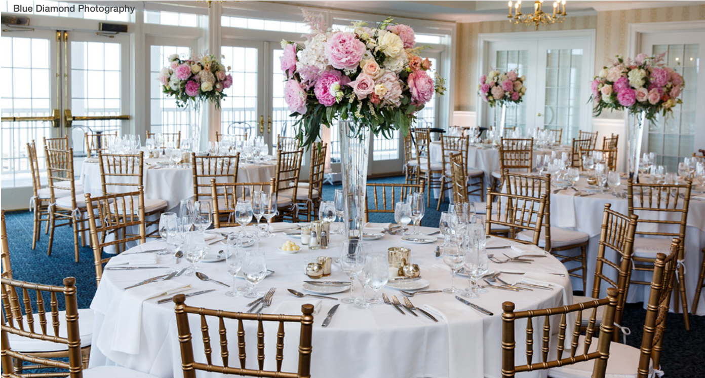
Blue Diamond Photography