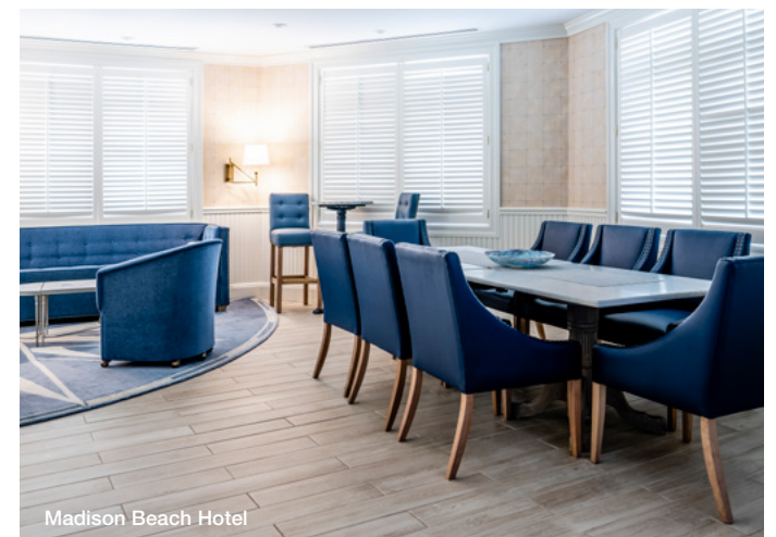
Madison Beach Hotel