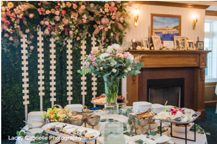
Lacey Gabrielle Photography