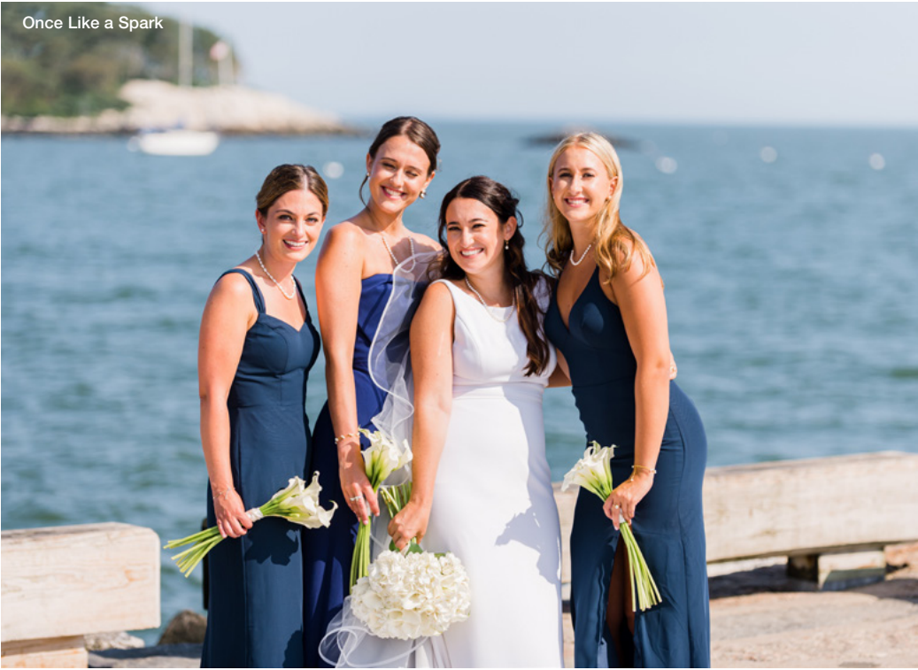
Once Like a Spark