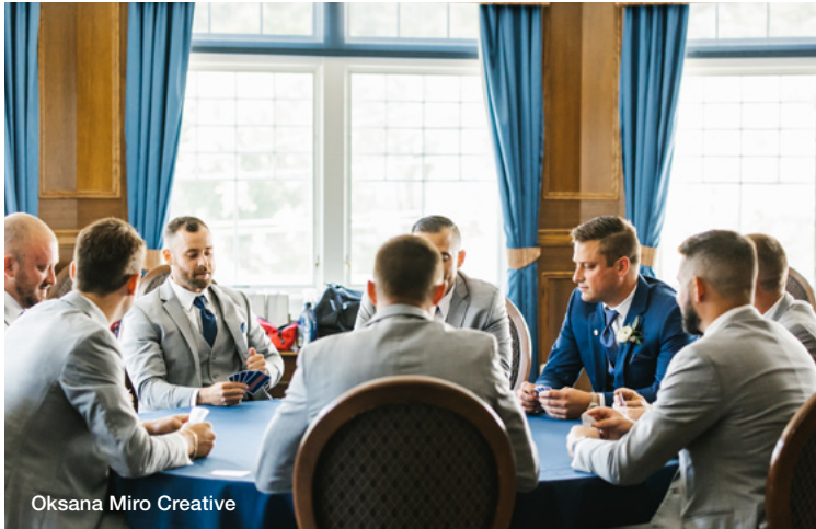
Oksana Miro Creative