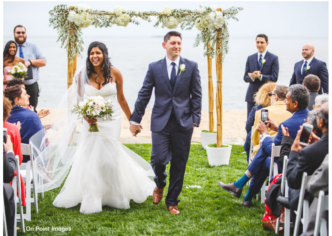
On Point Images