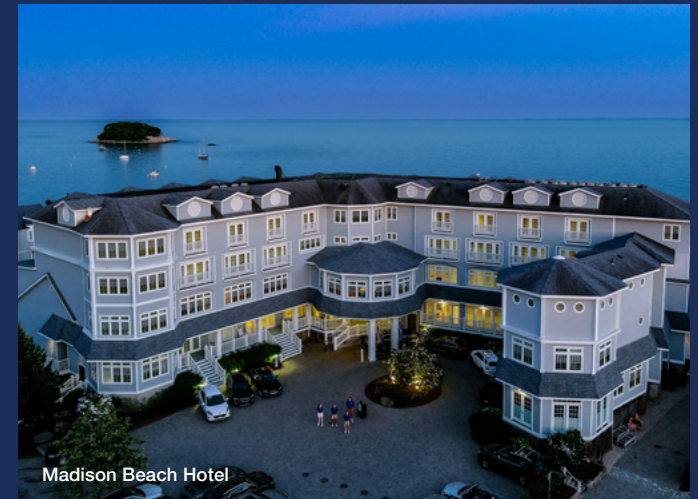
Madison Beach Hotel

One visit and Madison Beach Hotel, Curio Collection by Hilton, will become your favorite destination for future escapes, long after you've exchanged your vows.