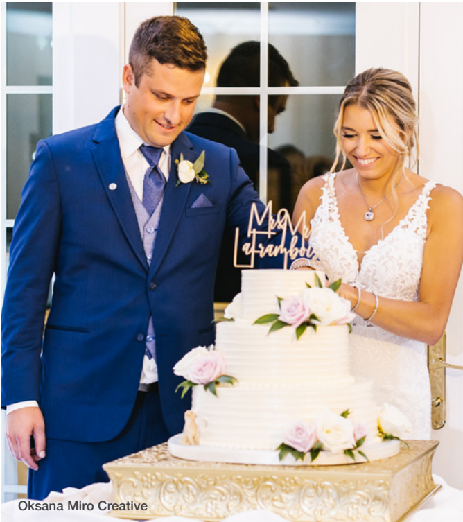
Oksana Miro Creative