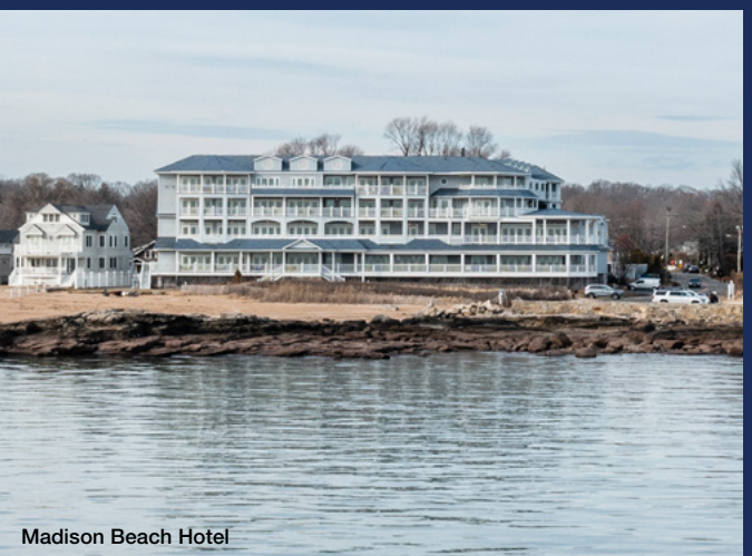
Madison Beach Hotel